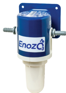
EcO 3 Ice Low Flow Ozone System HS-5282