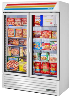
Standard White Exterior