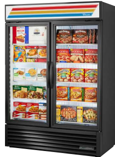
Optional Black Exterior