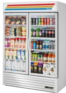
Optional White Exterior