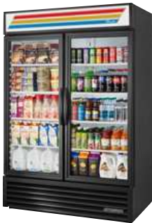
Standard Black Exterior