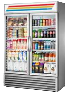
Optional Stainless Exterior