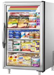
Optional Stainless Exterior