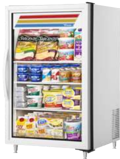
Optional White Exterior