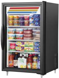
Standard Black Exterior