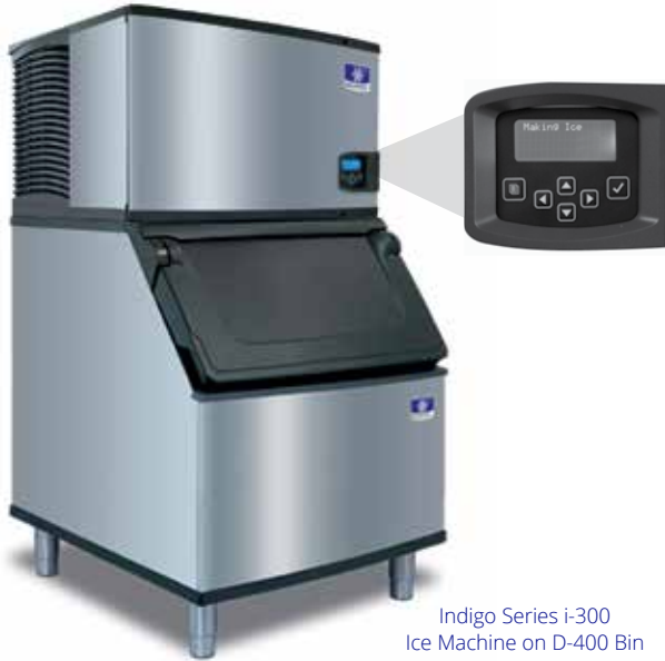
Indigo Series i-300 Ice Machine on D-400 Bin

Designed for operators who know that ice is critical to their business, the Indigo® Series ice machine's preventative diagnostics continually monitor itself for reliable ice production. Improvements in cleanability and programmability make your ice machine easy to own and less expensive to operate.