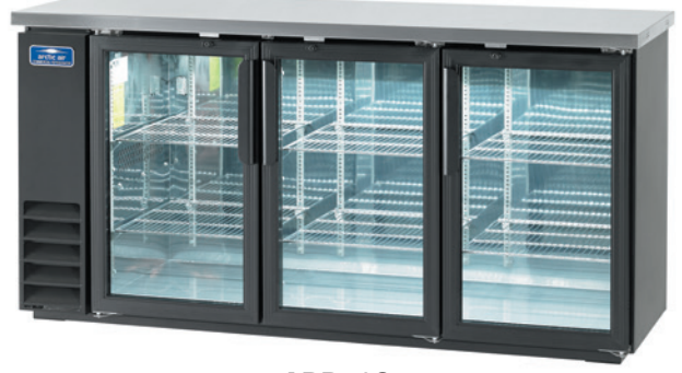
ABB 72 G